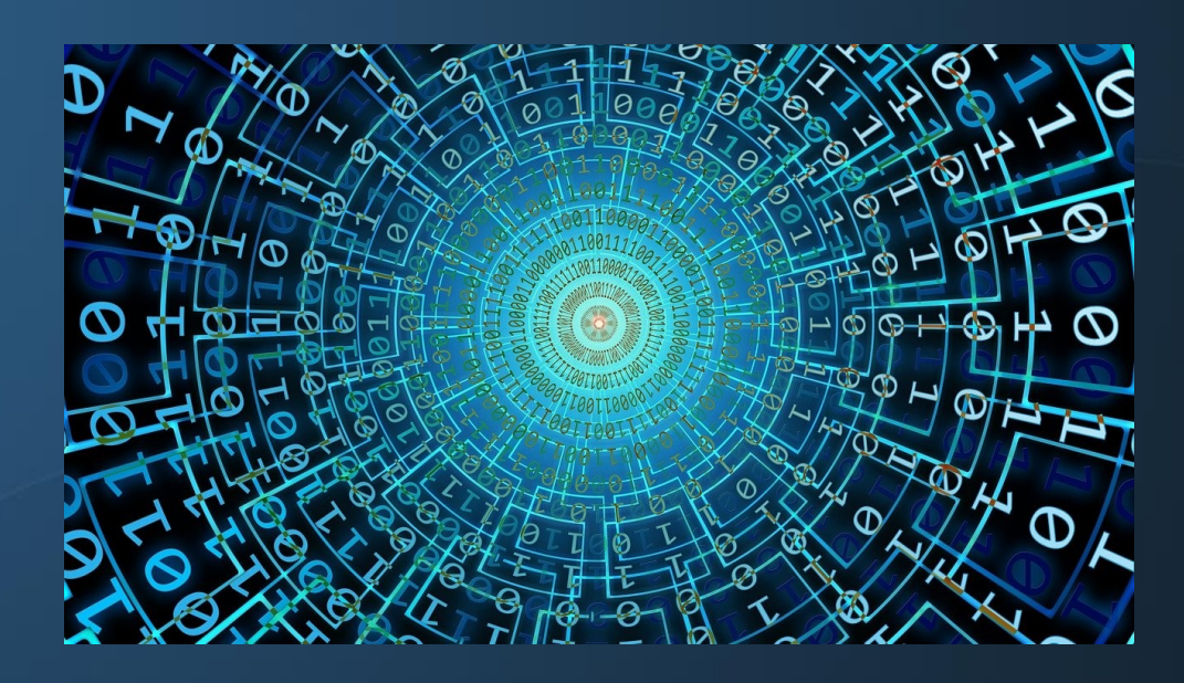
Software design best practices